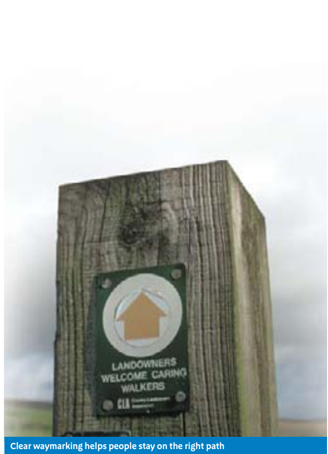
Clear waymarking helps people stay on the right path

Objectives that provide improved access over and above the requirements of the undertakings such as car parks, picnic areas, improved access for people of all abilities, additional events, educational visits and links to public transport need to be clearly identified as voluntary enhancements .