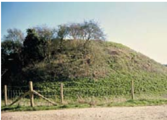
Protect key features through management