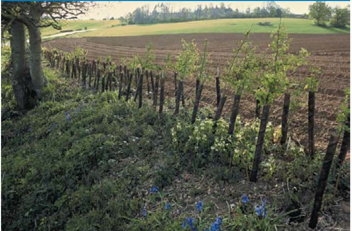
New hedgerow planting: voluntary enhancement