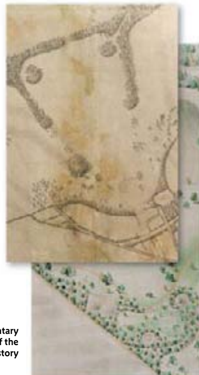
Documentary evidence of the property's history