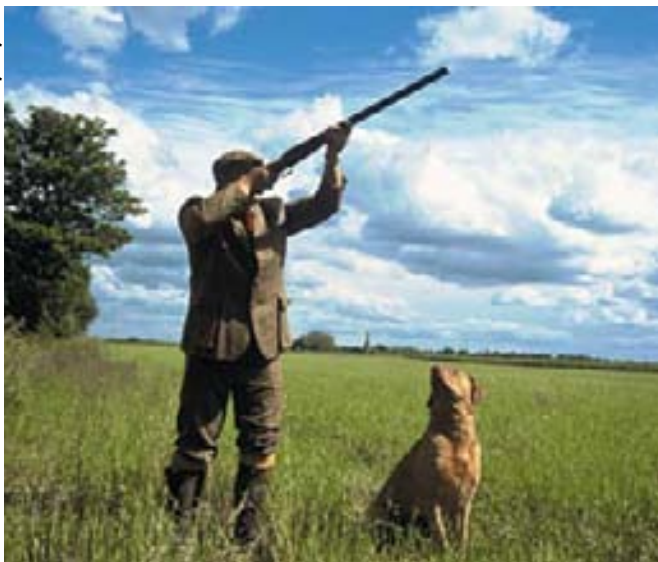
Strike a balance between the different interests of shooting, agriculture and outstanding land