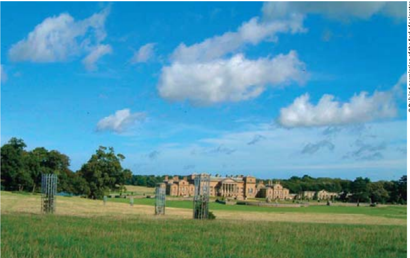
New planting in historic parkland

It is helpful to include an objective to seek advice from Forestry Commission on the preparation of woodland plans or their amendment.