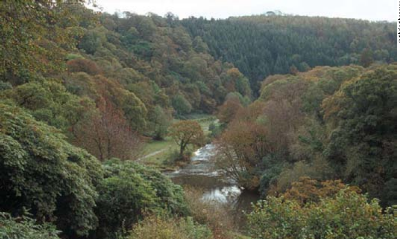
Woodland can be a key feature of outstanding land

Some HMPs include an objective to attain environmental certification status to improve the marketability of the timber products as well as to meet other HMP objectives.