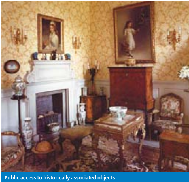
Public access to historically associated objects