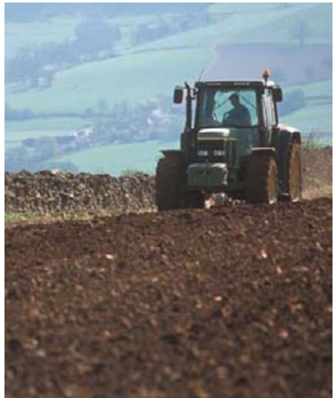
Protect drystone wall