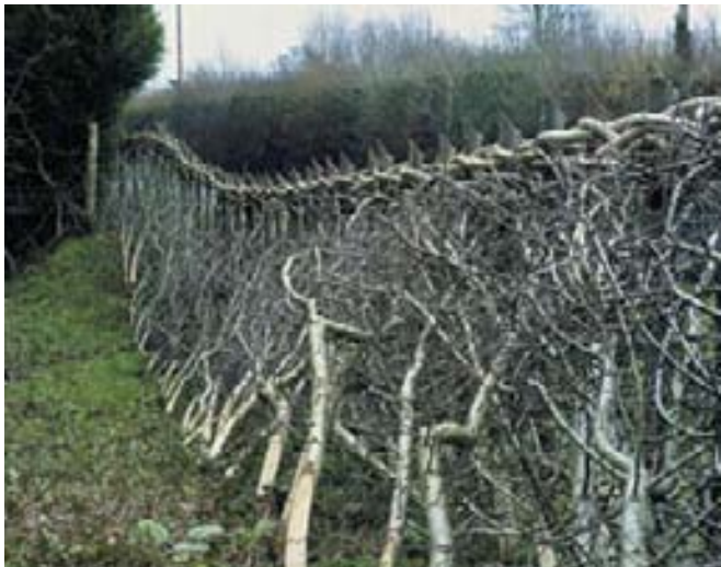
Traditional hedge management