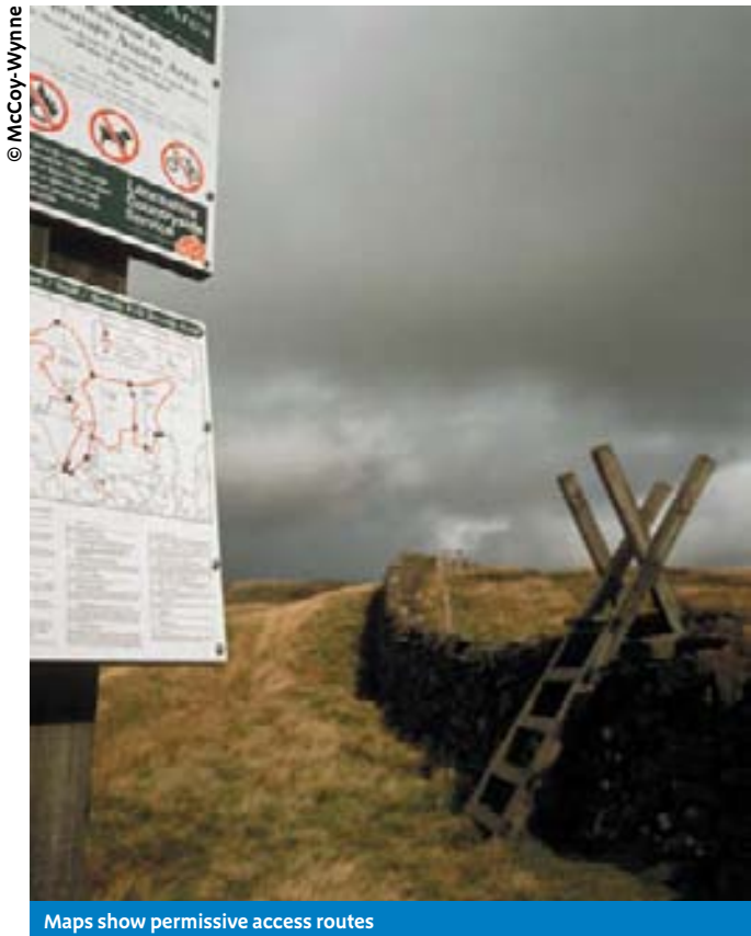
Maps show permissive access routes