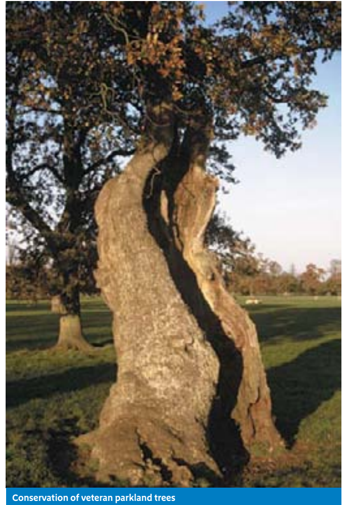
Conservation of veteran parkland trees