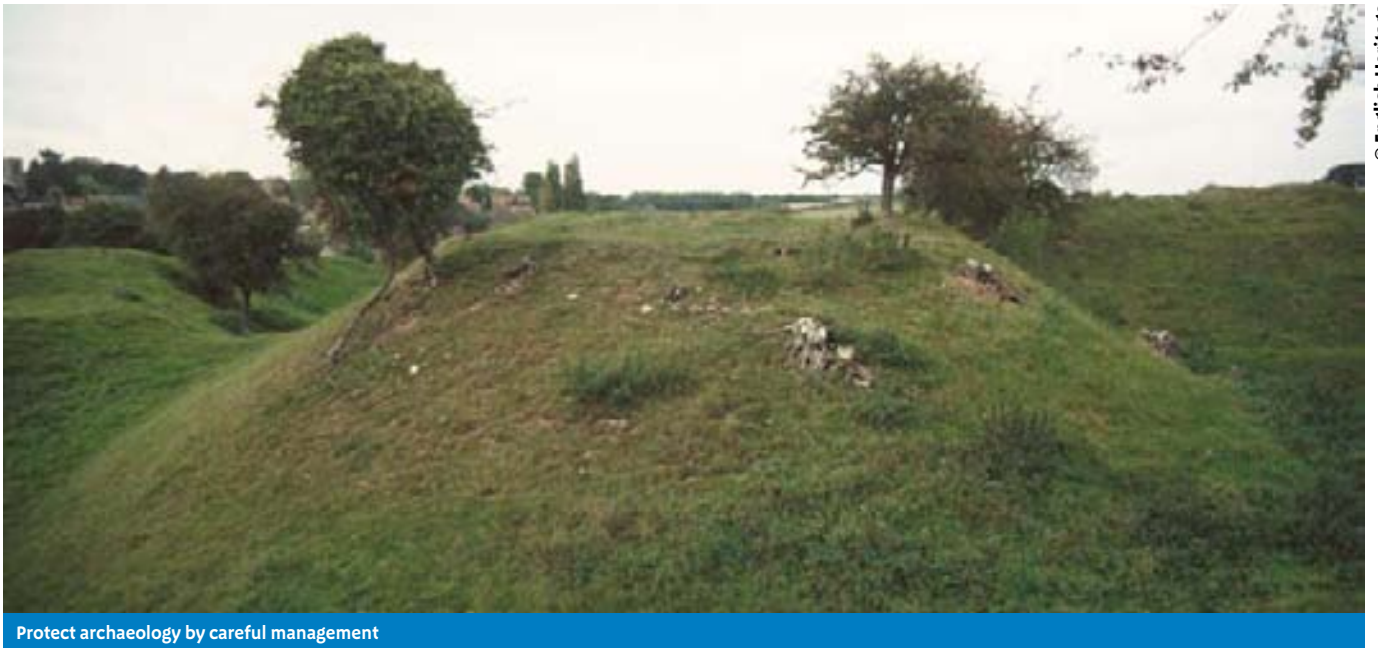
Protect archaeology by careful management