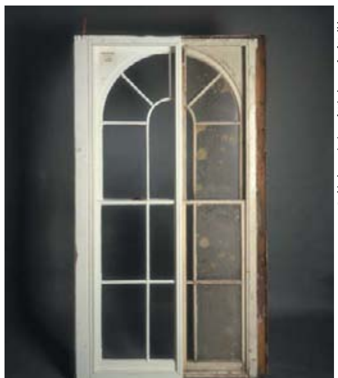
Five-yearly window maintenance programme