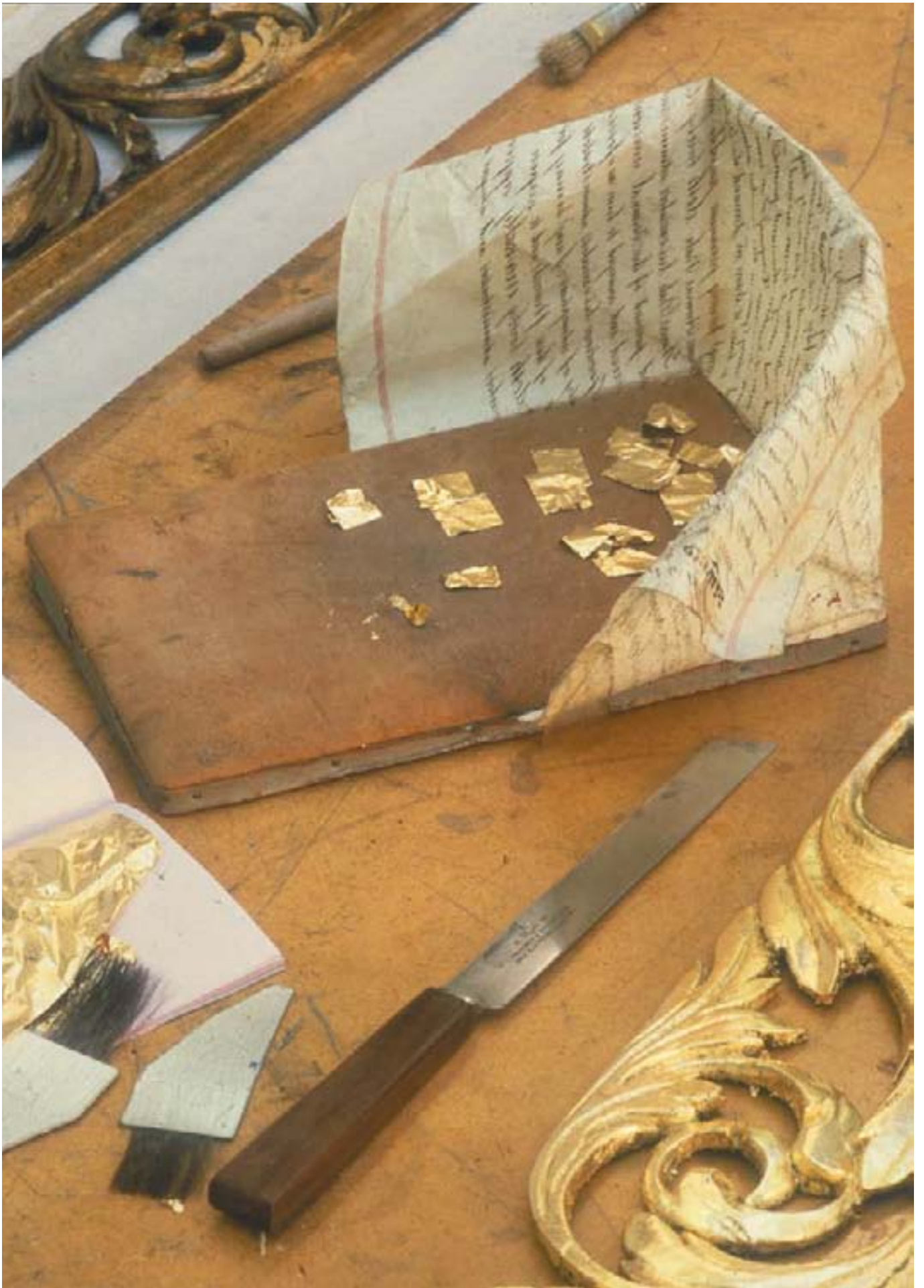
Conservation repair of outstanding buildings