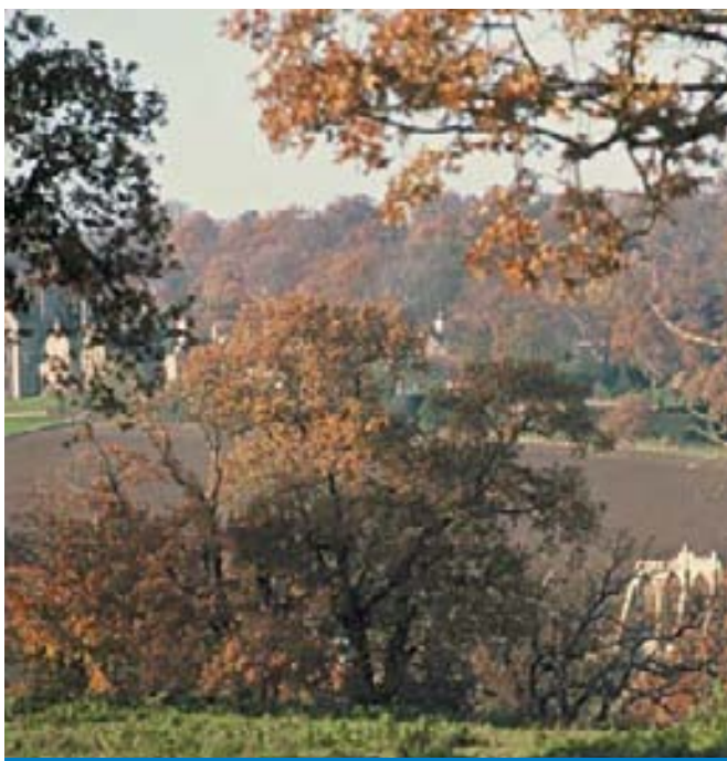
Identify significance to help strike a balance between scenic, historic and scientific interests and the requirements of access, agriculture and forestry