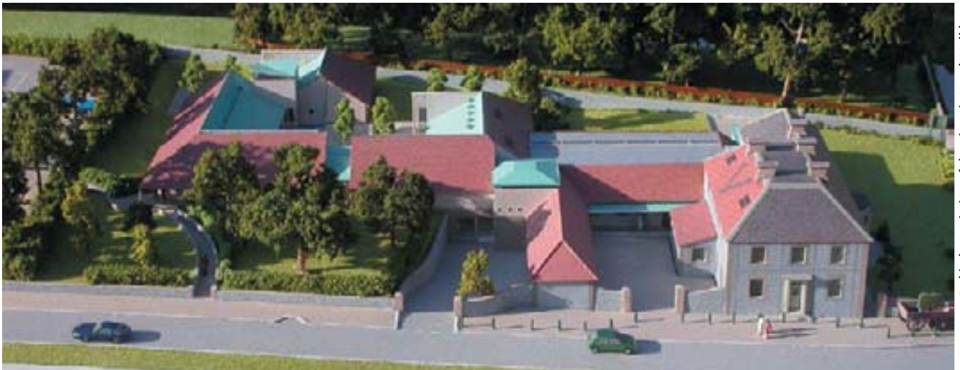
Proposals that preserve outstanding interest and enhance commercial viability. Proposed extension to Victoria Hotel, Holkham