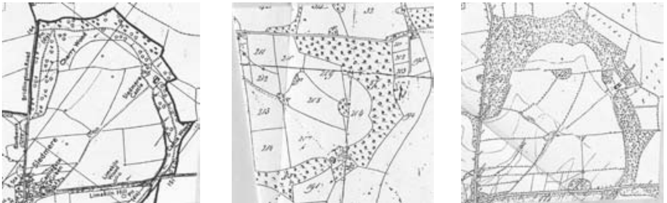
Historical maps inform management decisions