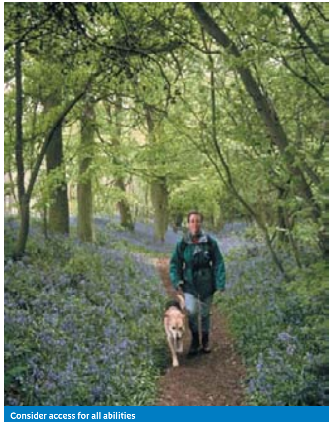
Consider access for all abilities