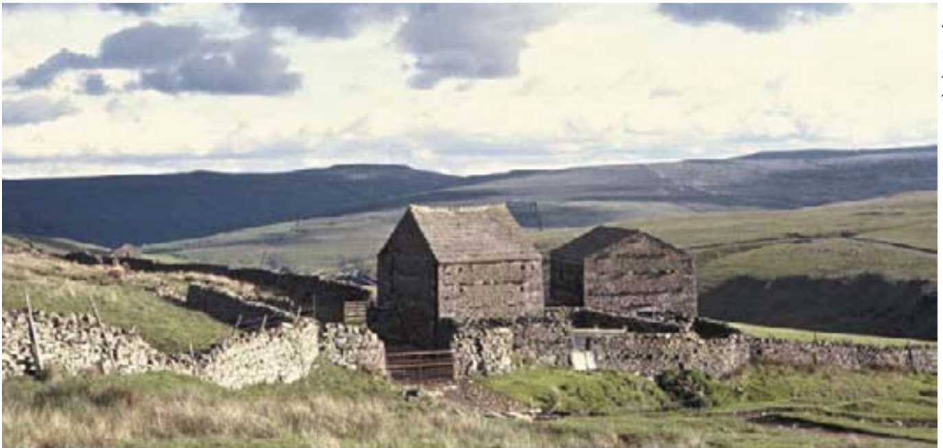
Redundant farm buildings – a management concern