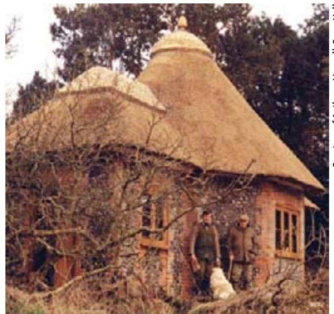
Proposals that preserve outstanding interest and enhance commercial viability. Conversion of the Butterly at Berry Hall to bed and breakfast accommodation

NB: Consulting HM Revenue & Customs before the sale or disposal of any part of the property will help protect owners from inadvertently jeopardising the exemption as a whole.